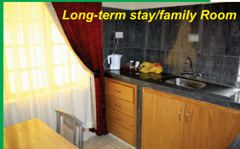
Long-term stay/family Room

The rooms are spacious, air-conditioned and all rooms have ensuite bathrooms with a shower. Rooms are provided with tea/coffee making facilities and television with 5 Channels. The compound is secured by an electric fence connected to a response security company. A full time security guard is also employed.