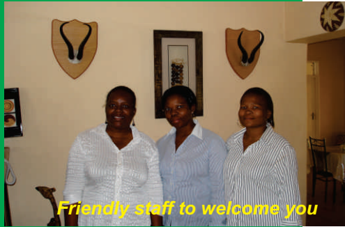
Friendly staff to welcome you

Kgale View Guest House welcomes bed & breakfast (B&B) guests into their homes. Everything at Kgale View Guest House is made to make you feel at home. With home made type dishes, DSTV channel, secure rooms, relaxing gardens, a swimming pool and caring hospitality, we make you feel like part of the big Kgale View Guest House Family.